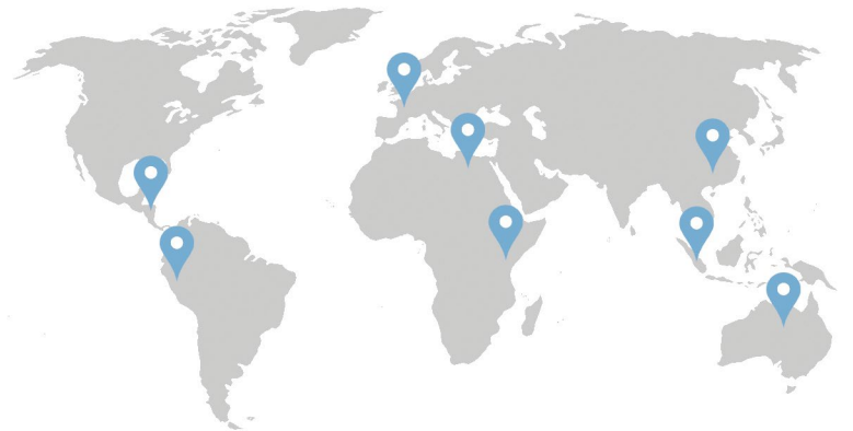
Egypt, Australia, Belize, Ecuador, England, Europe, Kenya, Asia & China